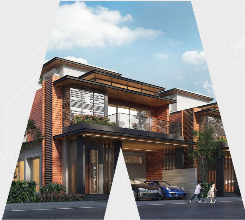
A PURAVANKARA HOME AT SPARKLING SPRINGS